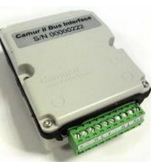
Camur II Bus Interface